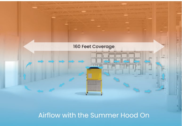
Airflow with the Summer Hood On

Easily install this air deflector and notice the change in comfort of your industrial space temperature.